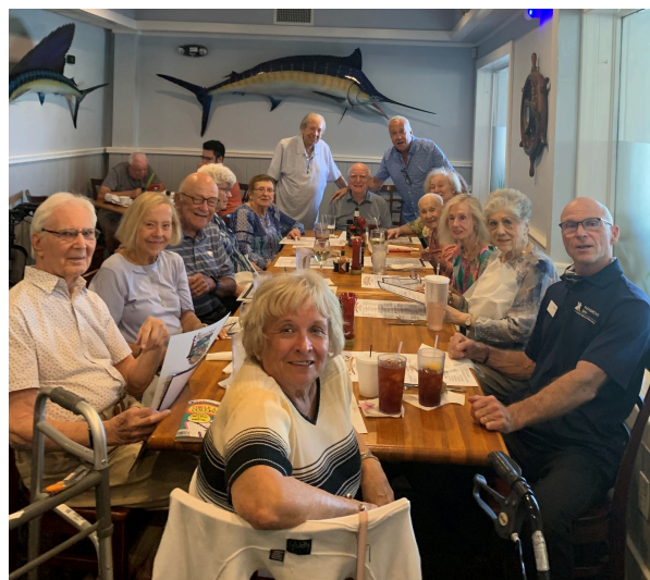
Residents enjoy dinner at Schooners' seafood restaurant a Jupiter landmark since 1984.

August is known for being the "Dog Days of Summer" and we are in the thick of it here in South Florida. The theme for August is Experience Adventure and we are looking forward to a private tour of Loggerhead Marinelife Center in Juno Beach. Followed by lunch out to the always popular Hurricane Cafe! For our New Poetry Hour we are featuring "The Spirit of Adventure" with a focus on poems by Amelia Earhart, who knew she was poet too?! In our team trivia we will have questions on "Wild America" and "World Explorers"! Let the adventures begin, Mangrove Bay style!!