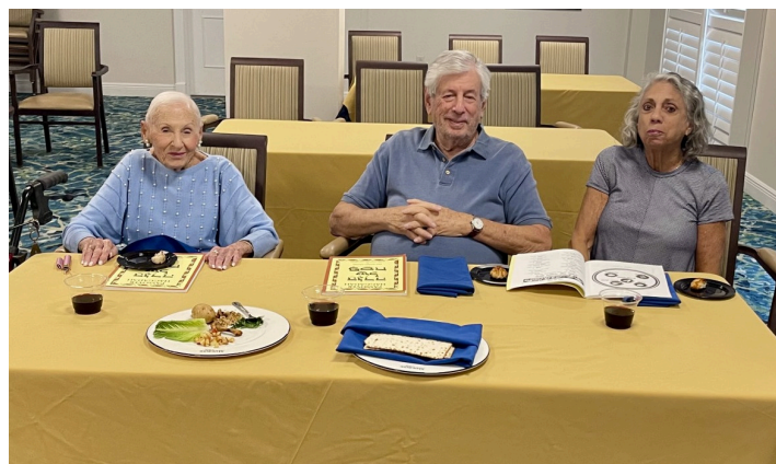
Passover Seder Service!