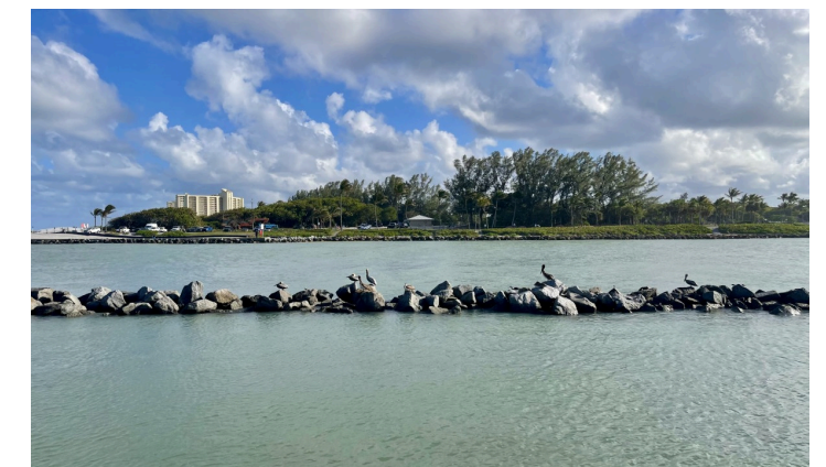
Pelicans on the Jetty at Jupiter Inlet